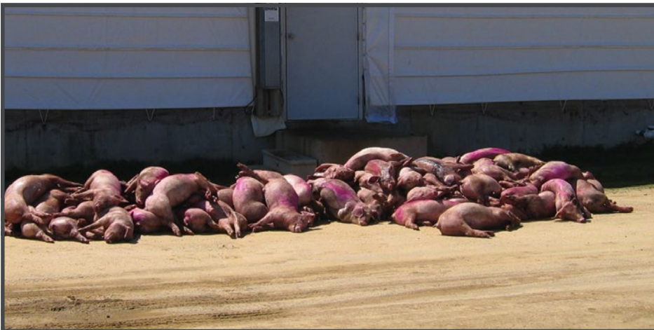
HIGH DEATH LOSS

African swine fever (ASF) is a highly contagious and deadly viral disease of pigs. Pigs infected with ASF may look similar to animals infected with other diseases including classical swine fever, porcine reproductive and respiratory syndrome (PRRS), and porcine circovirus associated disease (PCVAD). Possible signs of disease are shown below.